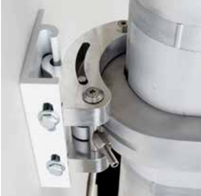
Functional design: the solid metal wall fixings allow for easy mounting and ensure the highest possible security.

The new cassette awning KGM 20 does not need to shy away from comparison. With its 4-m support-free projection and a width of up to 20 m, it is one of the biggest of its kind. It is based on the proven concept of a cassette awning and is suitable for garden seating areas or restaurant terraces. Wherever it is used, the cassette awning KGM 20 provides ample shading.